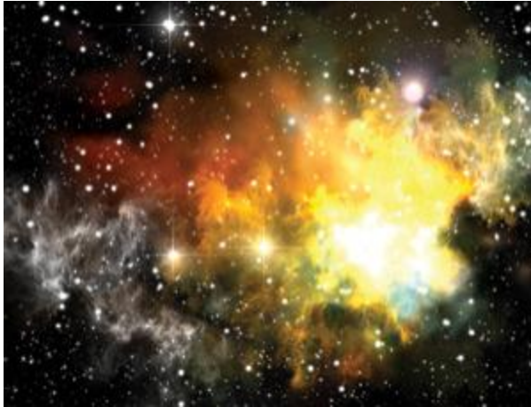
It wasn't always here